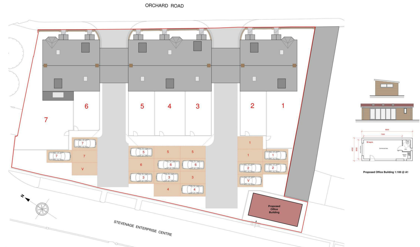
29-31 ORCHARD ROAD, STEVENAGE, HERTS. PROPOSED SITE PLAN